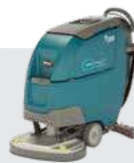
Dual Cylindrical: 20 in / 500 mm