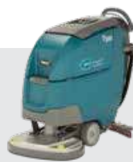
Dual disk: 24 in / 600 mm