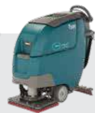
Orbital: 20 in / 500 mm