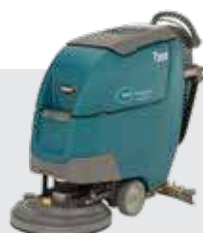
Single disk: 17 in / 430 mm & 20 in / 500 mm

The T300 scrubbers have multiple machine head types to fit your cleaning applications and optimize cleaning performance for specific areas.